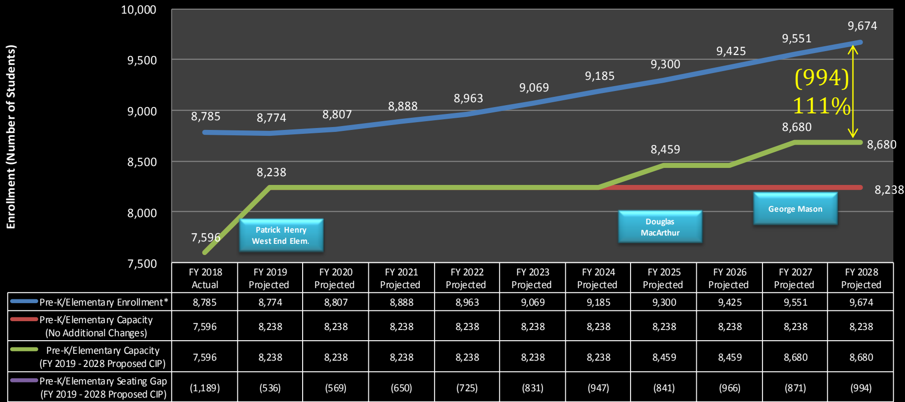
ACPS Elementary Projected Enrollment and Capacity: FY 2018 - 2028