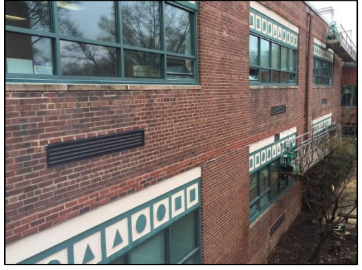
Exterior masonry and flashing.