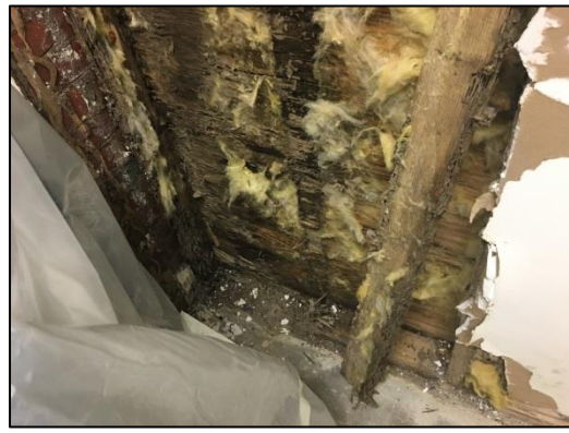
Close-up of camera line.