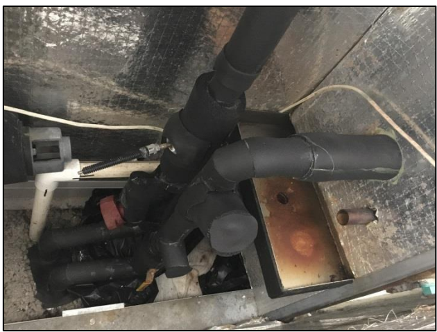
New fan coil unit pipe insulation.

PTA Meeting - Mt. Vernon Community School Building Assessment ACPS Alexandria, Virginia