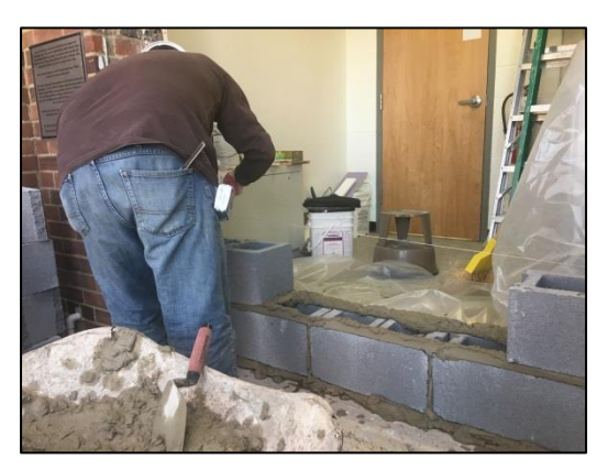
Camera in drain line.