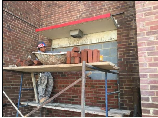
Tracing camera in auditorium.