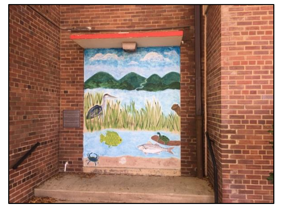
Running camera in drain line.