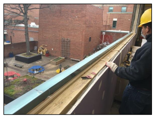
Window system under repair.