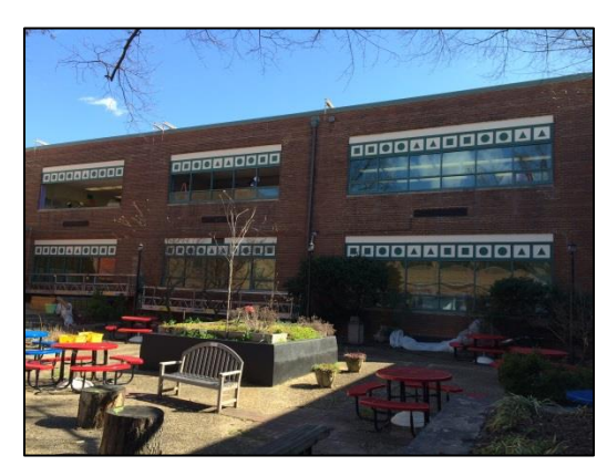
Repaired window system.