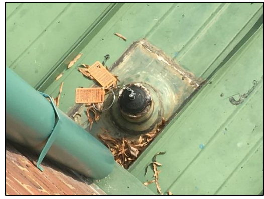
Plugged interior drain line.