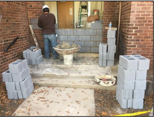
Plugged interior drain line.