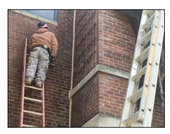
Following camera in drain line.