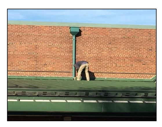
Camera in drain line.