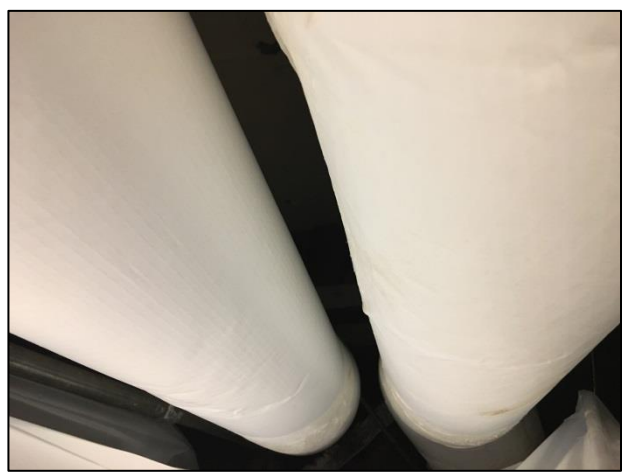
New dual temp pipe insulation.