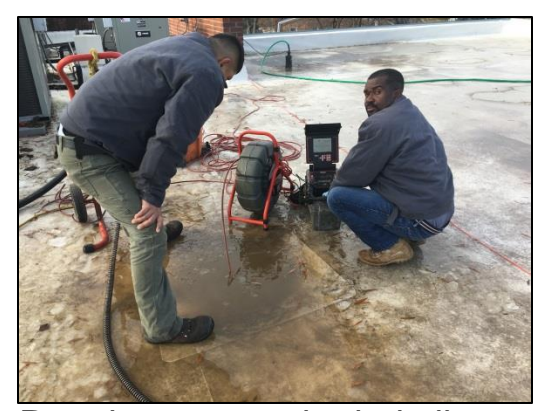
Running camera in drain line.