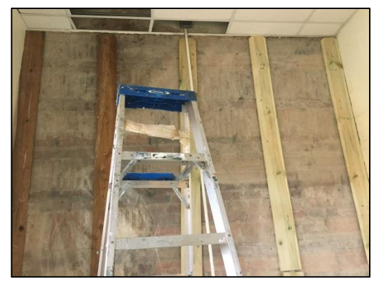
Interior wall vapor barrier.