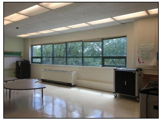
Repaired interior wall.