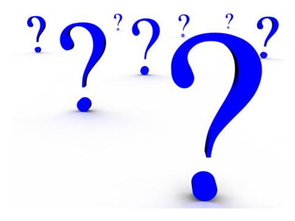
<u>This Photo</u> by Unknown Author is licensed under <u>CC BY</u>