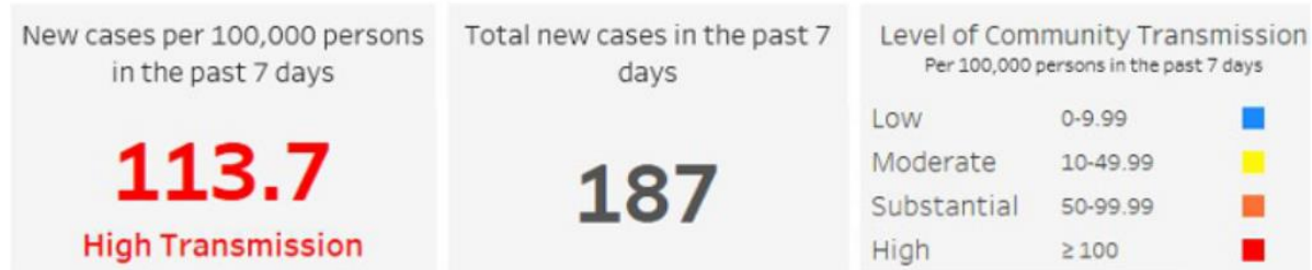
Total new cases per 100,000 persons in the past 7 days Most recent 90 days shown