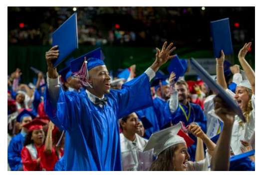
School Board Meeting

Department of Curriculum and Instruction