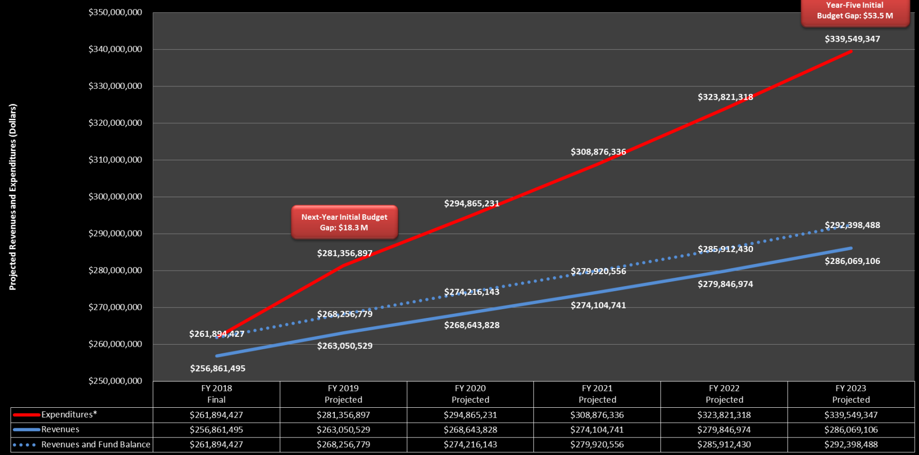
Operating Fund Fiscal Forecast: FY 2018 - FY 2023

*Expenditures include Operating Fund transfer to Grants Fund in support of VPI.